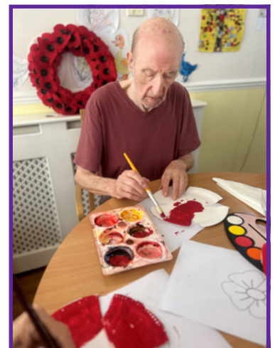
Arts & Crafts